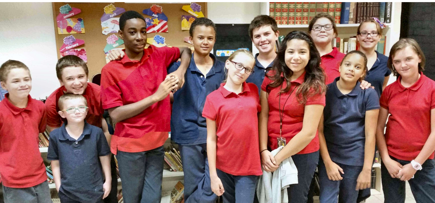
After a brief enrollment period, 12 students were registered, becoming the pioneers of the new school.