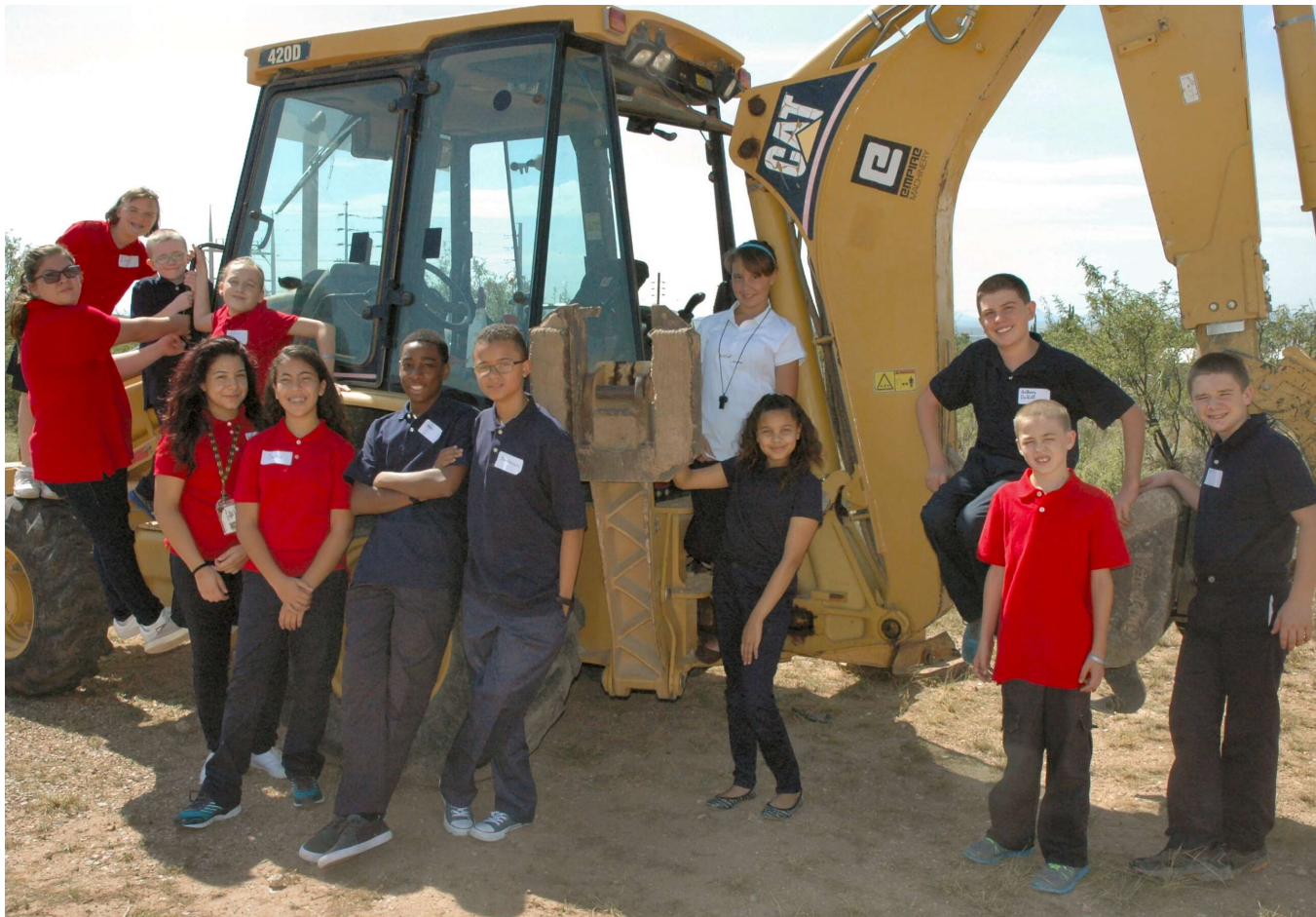
Students examine the earth-moving equipment during the groundbreaking for their new school.