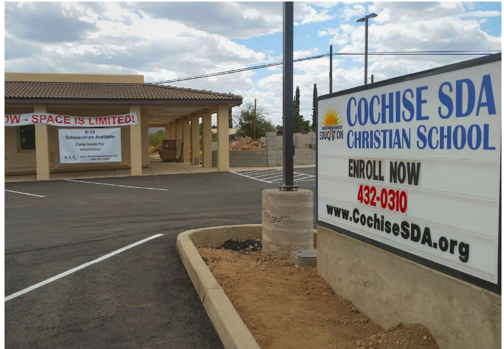
Today, Cochise SDA Christian School is an example of a faith-based effort that has inspired an entire community.